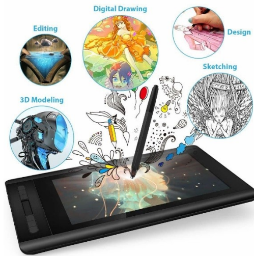
Tablet : a device that can be used by artists to create art on.

Online market : it's a new way to sell art by internet which is a platform where everyone can have an access and buy things.